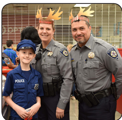
El Paso County Sheriff's Deputies participate in the Shop With a Cop program at Target in December of 2018. The annual holiday event helps build positive relationships by pairing officers with elementary school students as they shop for holiday gifts for their families with gift cards donated by police and retailers.

El Paso County's departments of Human Services, Planning and Community Development, and Public Health were recognized in July of 2018 with Achievement Awards from the National Association of Counties (NACo) for innovative and effective county government programs that strengthen services for residents, including a program to help support court-involved clients in receiving Health First Colorado assistance.