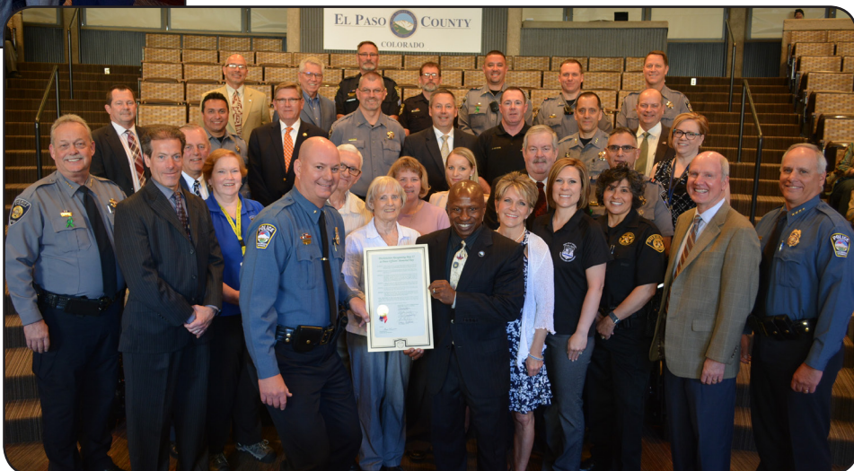
The Board of El Paso County Commissioners recognize the dedication of the Peace Officers Memorial in May of 2018, honoring officers killed in the line of duty in El Paso and Teller Counties since 1895.