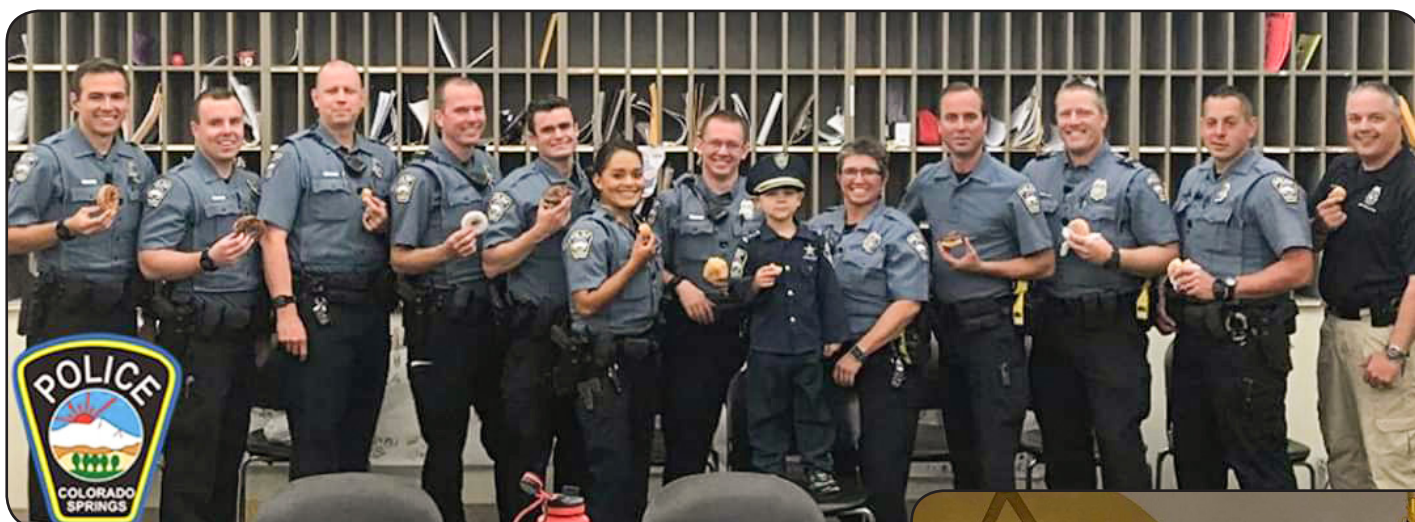
Colorado Springs Police comically enjoy delicious donuts.

Please visit the Criminal Justice Coordinating Council website at https://communityservices.elpasoco.com/community-outreach-division/justice-services/criminal-justice-coordinating-council