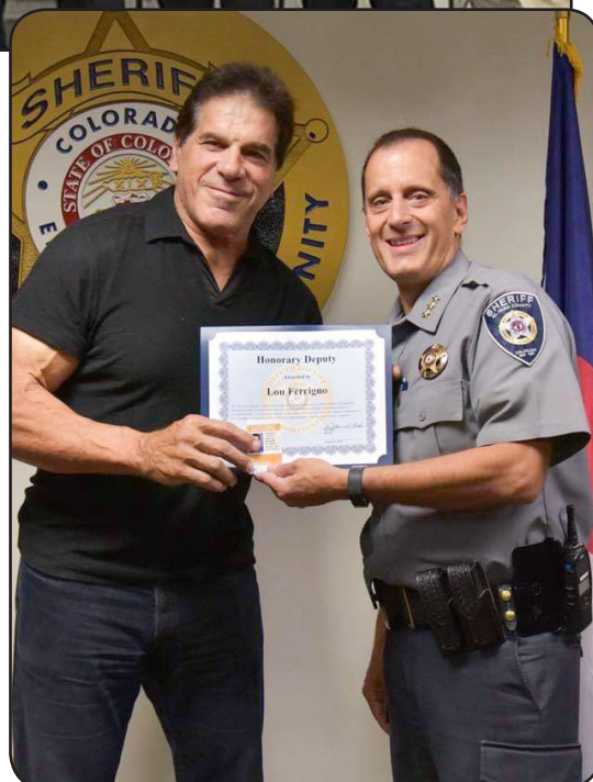
The original "Hulk," Lou Ferrigno, becomes an Honorary Deputy before attending Colorado Springs Comic Con in August of 2018.